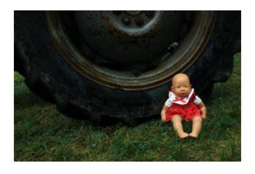
Opening The Tear Ducts How To Be In Touch With Your Vulnerable Side

Everything and everyone is susceptible to vulnerability at one time of another, be it at different stages and degrees. Thus it is important to understand the basics of vulnerability. Often described as the susceptibility of an individual, group, society or system to emotional or physical changes made either indirectly or directly impacting the fore mentioned.